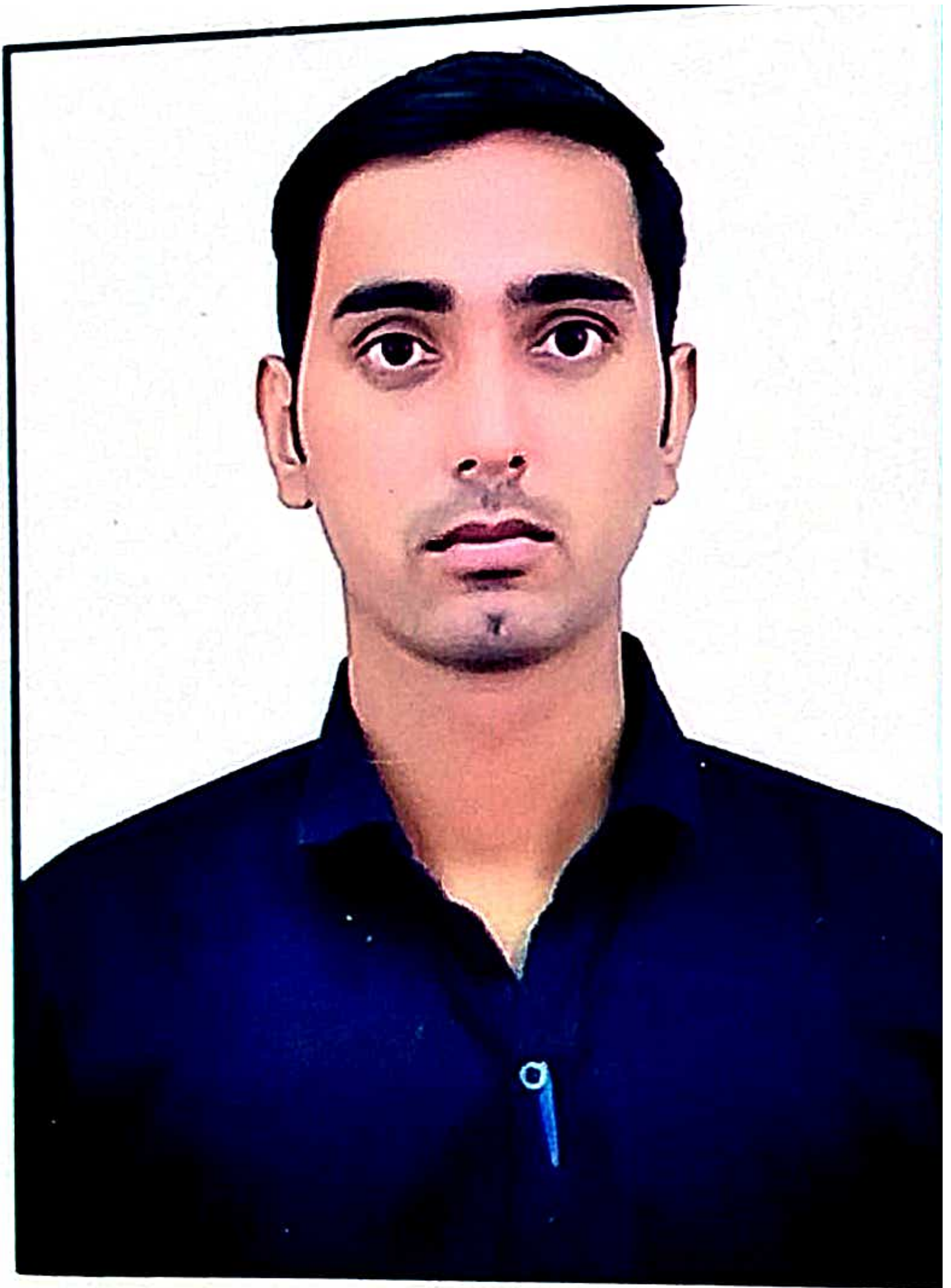
Portrait of a man with dark hair and a mustache, wearing a dark blue polo shirt.